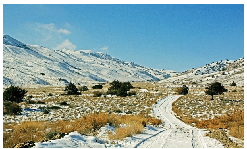
Figure 2. Almeh Valley, Golestan National Park

The park covers forested areas in the east, semi forested to bushlands in the center and semi desertic areas in the east. Natural and scenic beauty together with high biodiversity are features of the park (Figure 2).