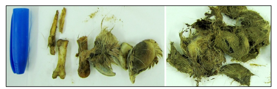
Figure 3. The prey remains of P. pardus in Golestan National Park.

protocol. The Control region of mtDNA was PCR-amplified using primers including L15995 (Taberlet et al. , 1994) and H16498 (Fumagalli et al. , 1996).